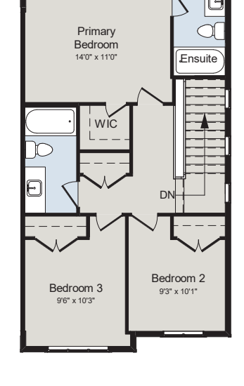
**INCLUDES 595 SQ/FT OF BASEMENT FINISHING